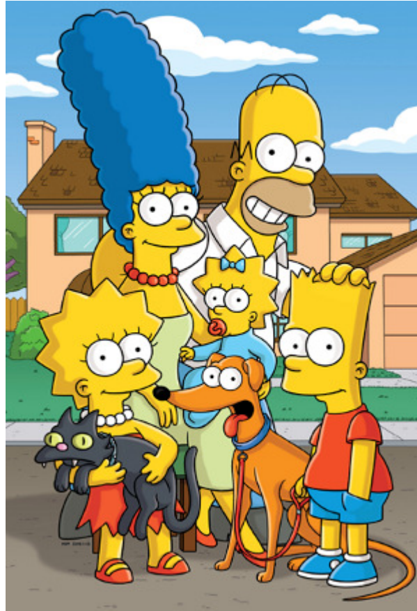
The Simpsons - Clockwise from left: Marge, Homer, Bart, Santa's Little Helper (dog), Snowball II (cat), Lisa, and Maggie in the centre

What is your favourite cartoon? Research the creator of it. Things to note: name, nationality, country, date of birth, achievements, interesting facts, dates in chronological order. Be careful of tenses – past achievements in past tense, present situation in present tense, and future projections in future tense.