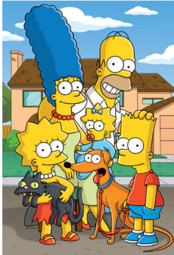
The Simpsons - Clockwise from left: Marge, Homer, Bart, Santa's Little Helper (dog), Snowball II (cat), Lisa, and Maggie in the centre

What is your favourite cartoon? Research the creator of it. Things to note: name, nationality, country, date of birth, achievements, interesting facts, dates in chronological order. Be careful of tenses – past achievements in past tense, present situation in present tense, and future projections in future tense.