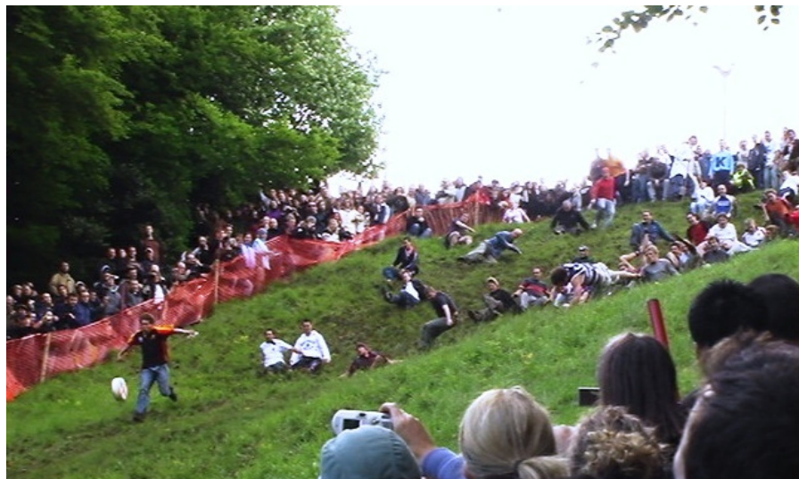
Cheese rolling festival